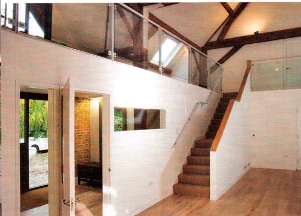
Above: The generous proportions of the original barn are celebrated with fluid open-plan spaces and ceilings that reach to the apex of the roof Below: Architect David Nossiter has completely opened up and reconfigured the interior, creating an ideal layout for family living. "Because it's all open, the children can ride around the entire ground floor on their scooters – it's great," enthuses Larissa, "especially after living in a tall, thin townhouse spread across several levels" Left: The open-plan kitchen-diner is the hub of this home providing plenty of space for the couple to entertain and for the children to play both indoors and out