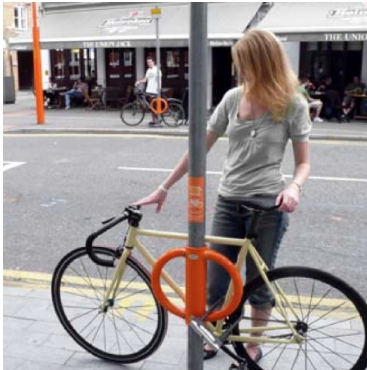
The Cyclehoop - which converts existing street furniture into secure bike parking - has recently been installed in the Bankside area and is one of the projects showcased at the NLA exhibition

The small Cyclised Cities exhibition at New London Architecture includes a selection of schemes and concepts to make